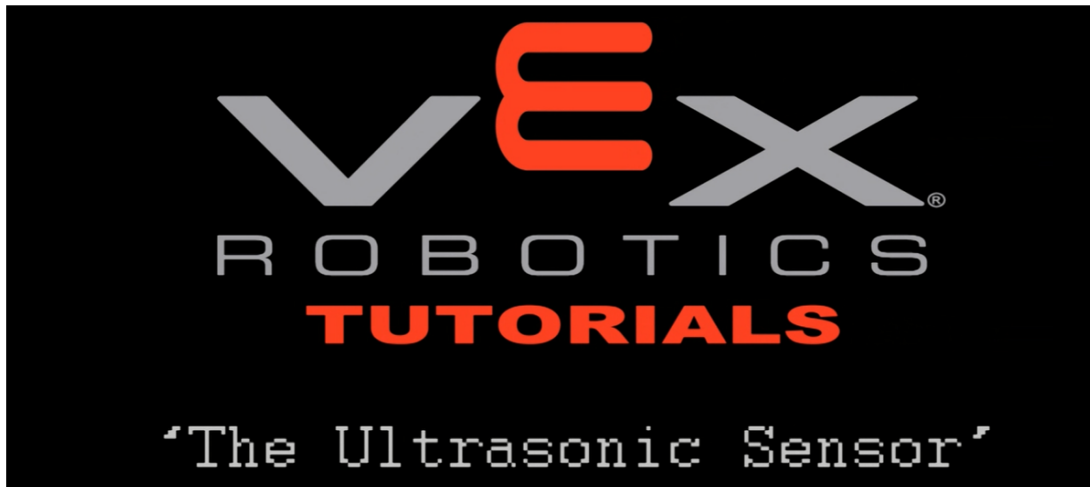
Title screen for the video.

The background music was given permission by the author, Approaching Nirvana, to be in the video with credit to them.