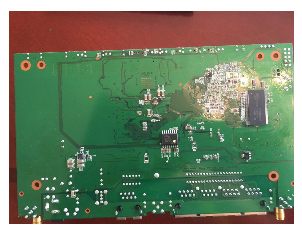
Bottom view of the circuit board