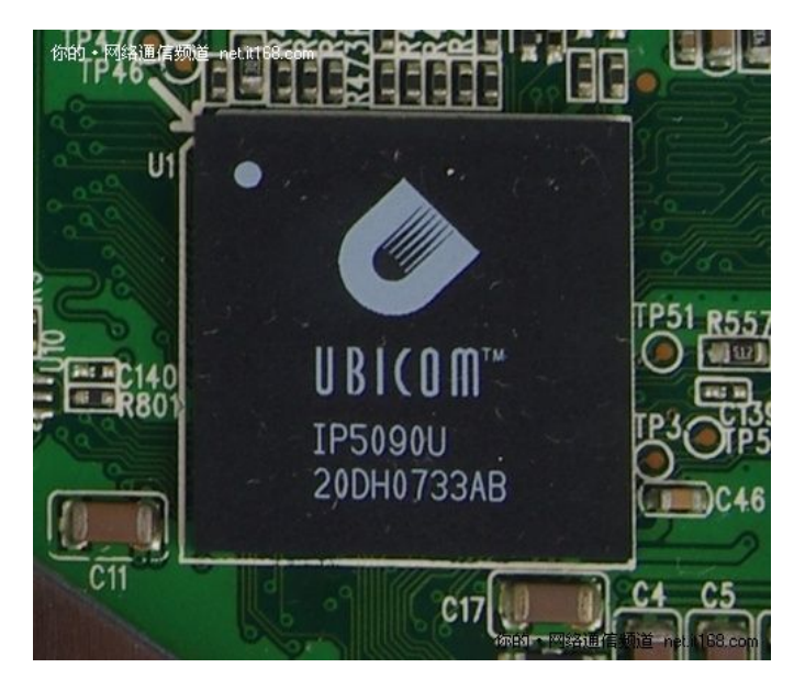
Ubicom IP5090U, revealed under the heatsink