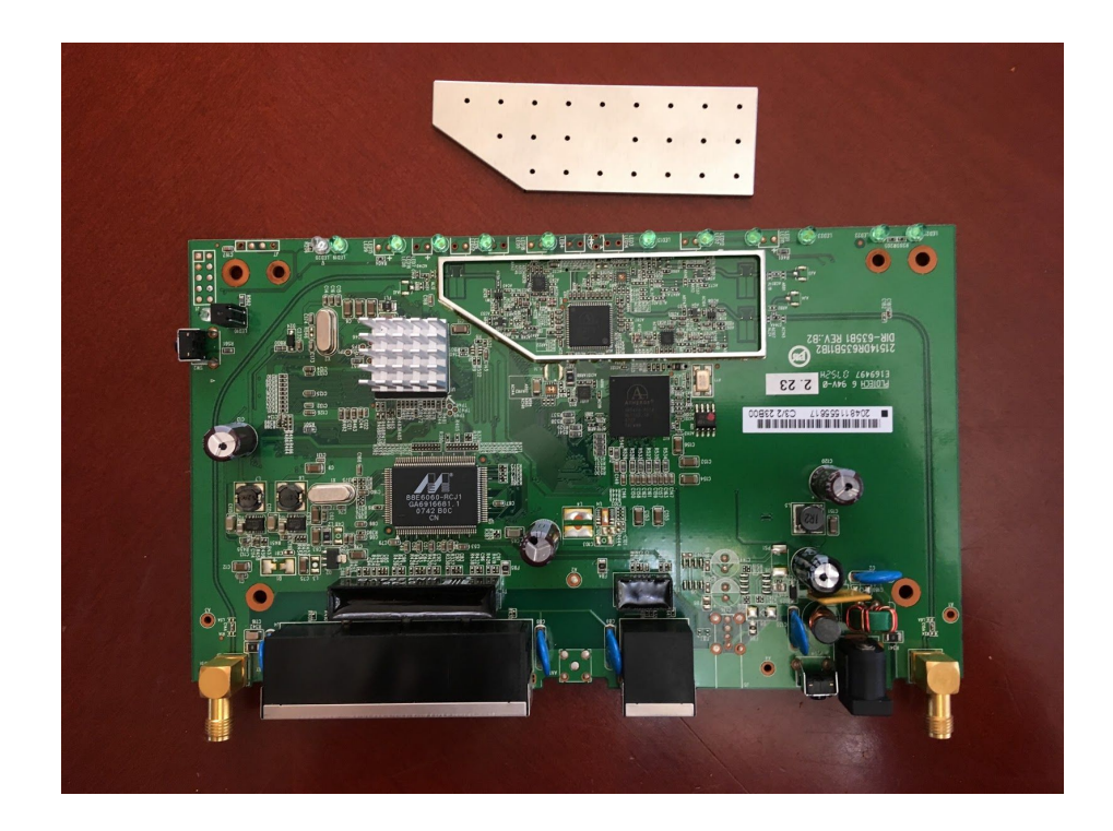
A metal plate is removed, exposing more parts including an Atheros chip.