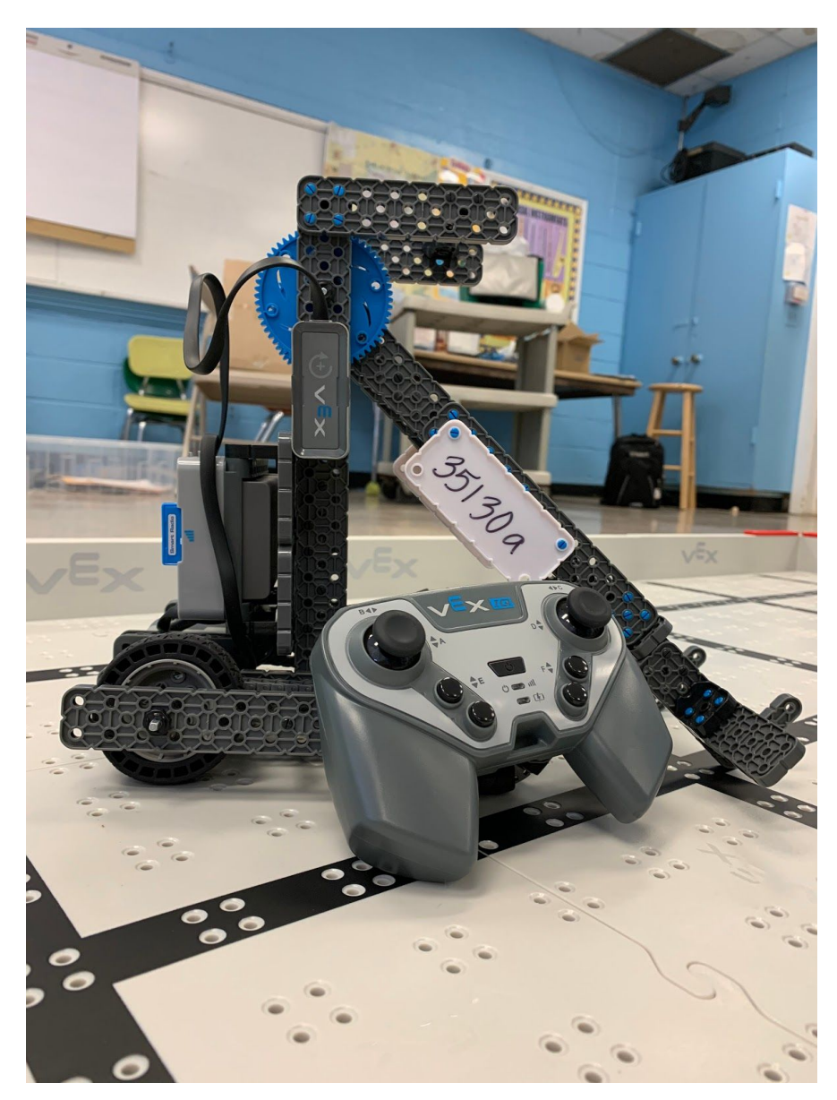
(Our robot now)

I think that it is important for everyone on the team to know all aspects of the robot. Even though we have only competed in one competition so far. I think we have learned a lot. I think by competing that some of the changes made to our robot came from paying attention to details and seeing what might have worked better for other teams. I think by making changes it makes us stronger as a team. We have to communicate, make choices, agree or disagree and come to an informed decision.