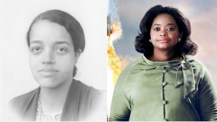
(Dorothy Vaughan in real life shown next to Octavia Spencer, actress who had played her in "Hidden Figures")

Our team has created an inclusive environment that attracts a more diverse group of students. Last year, when the CSMS Girl Power Team qualified for Worlds, we merged our team with that of Stallion Pride, because they had a phenomenal STEM Research project. Their project was a robot that can go into fires and complete tasks that firefighters are not able to. With Stallion Pride's excellent project, and our robot skills, we made an outstanding team. Not only did we have the best time at worlds as one team, but we also made such strong friendships, spending hours together, something we definitely would not have made if it weren't for VEX. This year we wanted to show new people how fun robotics can be, so we decided to add 2 new people to our team. The people we added were hesitant to join first, but now they love robotics. Since we believe girl power does not only mean for girls, one of the people that we added to our team, was actually a boy!