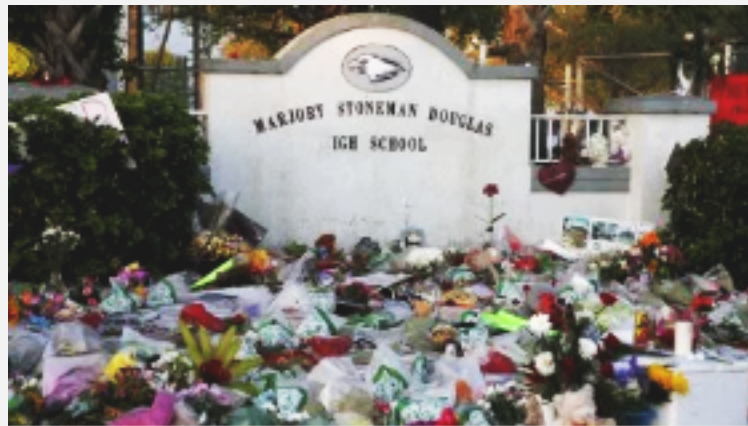
(Marjory Stoneman Douglas High School memorial for the 17 victims)

needed to use our girl power to get through this. Although February 14th was the worst day of our lives it gave us the strength to get the World competition.