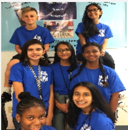
(Our team photo for our notebook)

Our team has created an inclusive environment that attracts a more diverse group of students. Last year, when the CSMS Girl Power Team qualified for Worlds, we merged our team with that of Stallion Pride, because they had a phenomenal STEM Research project. Their project was a robot that can go into fires and complete tasks that firefighters are not able to. With Stallion Pride's excellent project, and our robot skills, we made an outstanding team. Not only did we have the best time at worlds as one team, but we also made such strong friendships, spending hours together, something we definitely would not have made if it weren't for VEX. This year we wanted to show new people how fun robotics can be, so we decided to add 2 new people to our team. The people we added were hesitant to join first, but now they love robotics. Since we believe girl power does not only mean for girls, one of the people that we added to our team, was actually a boy!