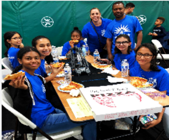
(The team eating pizza and having fun at a competition)

Girl Powered. Two words, yet so much meaning. What does girl power mean to us? Now, we could go on and on about what girl power means but in one word, girl power means "together". Everyone on our team working together. Having fun, together. Putting our differences aside, to come together to work for a bigger cause.