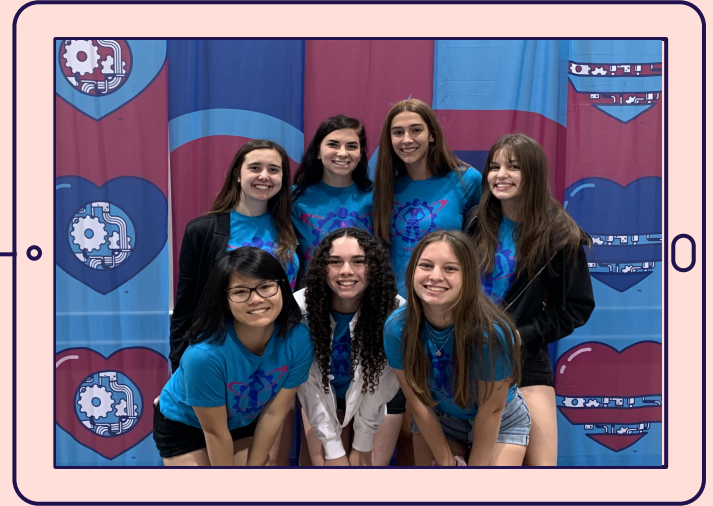
7983J and 7983W girls at VEX Robotics World Championships 2019

When I initially think of the phrase “Girl Powered,” I tend to think of women leading the charge in whatever program they are a part of. However, when I think more deeply about “Girl Powered,” it is much more layered than just being powerful. Being truly “Girl Powered” means women being listened to, women being treated equally, women getting the same opportunities as men. I also think of the system that has led to the necessity for this to be present today. The “Girl Powered” outreach has been tremendously successful since its beginnings in 2016 and has allowed for many women and girls to feel that STEM is an option for them.