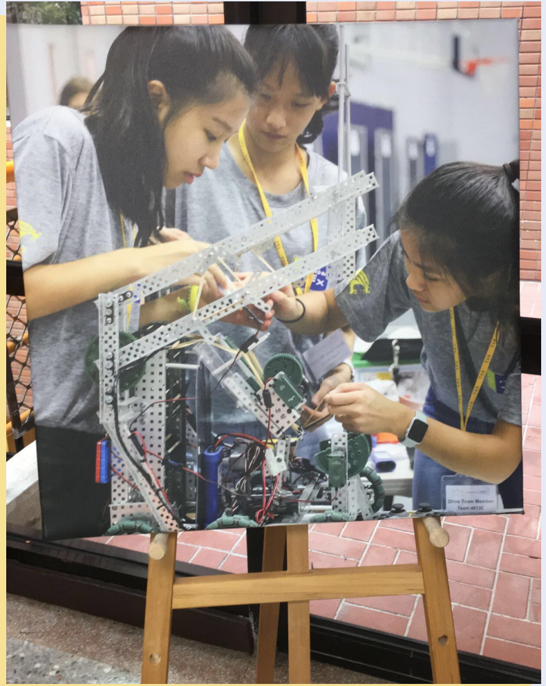
The school put up this picture in the hallways as a way to promote girls' involvement in STEM.

After our first year, we decided to continue doing VEX and told each other that we are going to do better next year. We showed our hard work and got recognized by the robotics teachers. Because of our determination, our school helped with promoting our all-girls team by putting up posters around the school. After our team managed to persevere through 2 years and even win some qualifiers, some girls started asking to join our team and