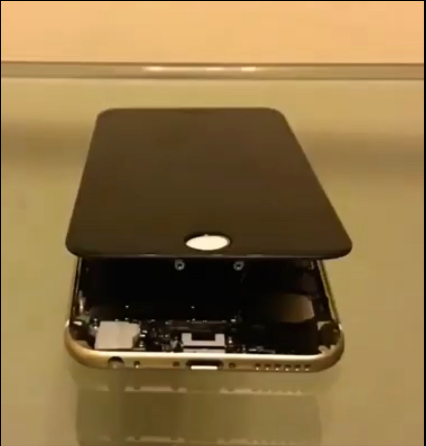
The phone halfway opened