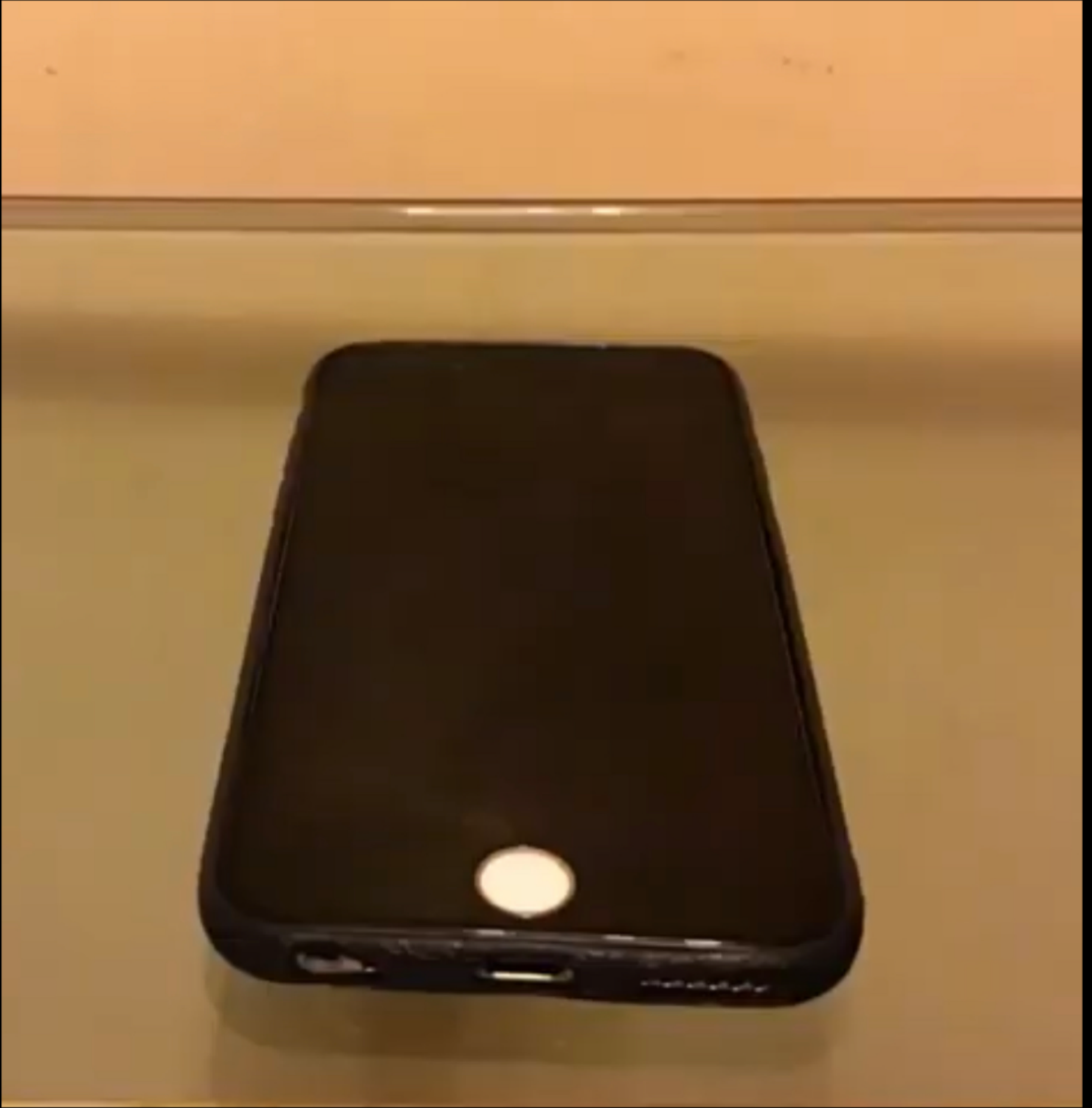
The phone before being opened