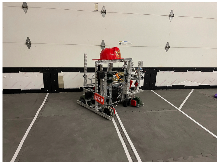
A First Responder

With thirty seconds until the hurricane arrived, the cities were not willing to risk the safety of the Neutralsvillagers