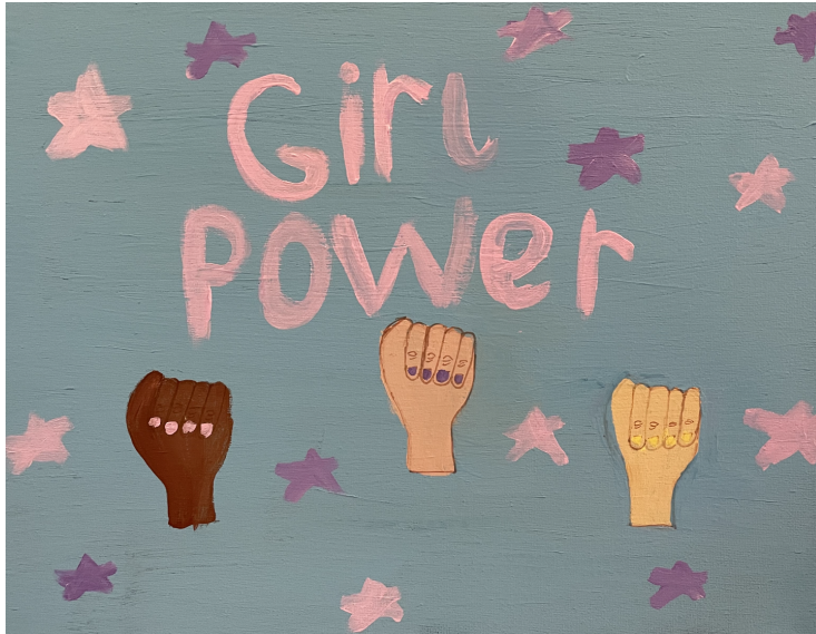
Acrylic Painting by Gabrielle

When I hear the phrase “Girl Powered” I think about all of the things girls can do now in the year 2022. For example there are more girls trying to get into Vex robotics for their elective than ever before, especially at my school. This is reflected in my team's approach to robotics by showing that girls can do what boys can do. To me “Girl Powered” essentially means just because girls are girls doesn't mean we can't do what boys can.