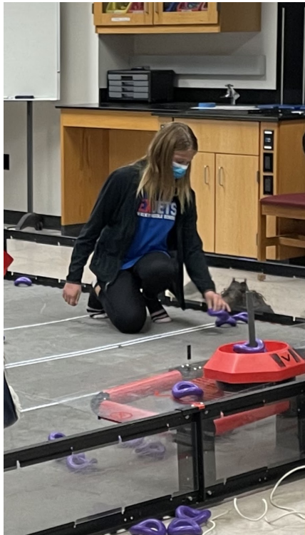
Photograph of me Field Resetting at Mt. SAC VEX Tournament in 2021

People on my team are encouraged to try various jobs. First, each person picks a main job at the beginning of the year but they are not required to do just that job. Some people pick one job but then they might also be a driver for competitions and do practice driving. Others pick more than one job to do at the start of the year. One person was a notebook person who also did coding but it got to be too much so he chose to do just coding. If someone on the team needs help you can go help them too. For example when me and the other coder were done with the code for the day we went to help build. We also help write in the engineering notebook at least once a week if not more. During tournaments people might do a job like field resetting (which I helped do at my last tournament). From this experience you learn how to do different jobs in the class and you learn different things. From this experience you also learn more skills.