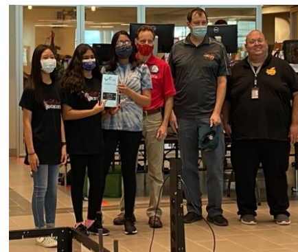
We won an award and made finals for the first time.