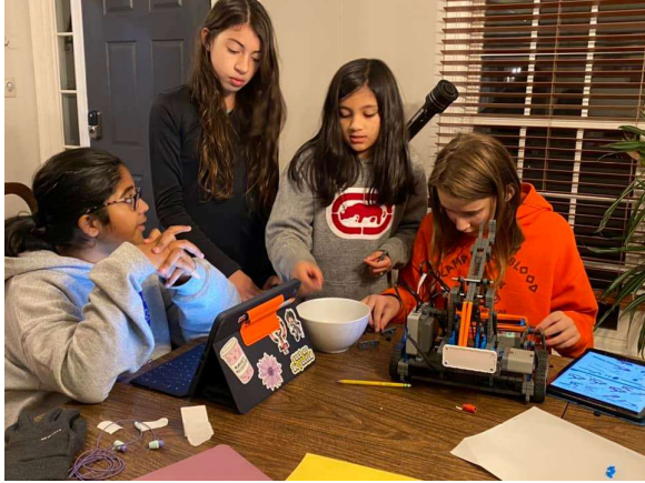
Work in session